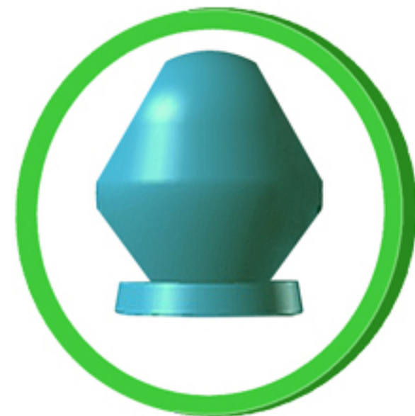
New Era 139

Pyramid technology is the culmination of years of core and coverstock analysis, research, and observation. With ever changing variables within the sport of bowling, (e.g., lane conditions, ball speed, rev rate) this technology allows any bowler, from stroker to two-handed, to achieve peak performance on medium to heavy oil conditions.